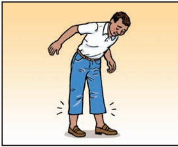
They're too short.