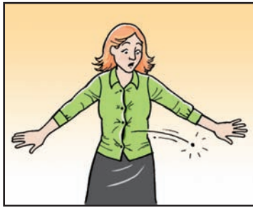
It's too small.