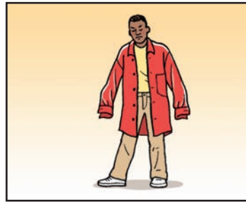
It's too long.